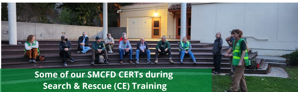
Some of our SMCDFD CERTs during Search & Rescue (CE) Training