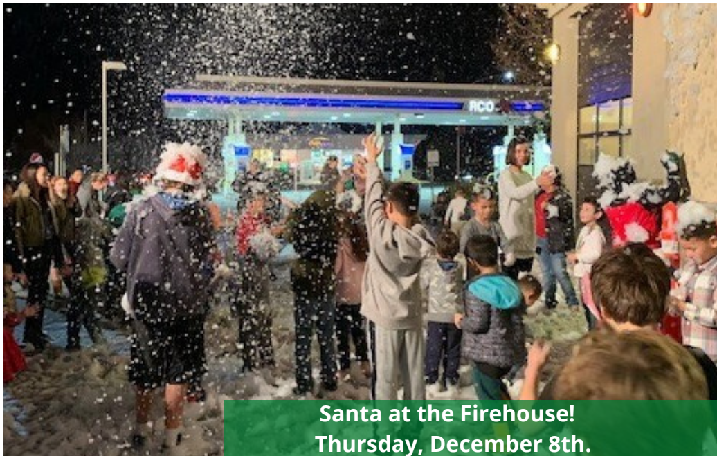
Santa at the Firehouse! Thursday, December 8th.

More info coming soon. But, please mark your new 2023 calendars!!!